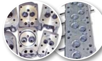
MB 300 SL

> The elimination of damaged areas and cracks